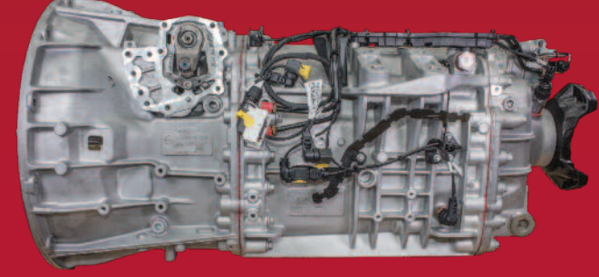
Detroit ™ DT12