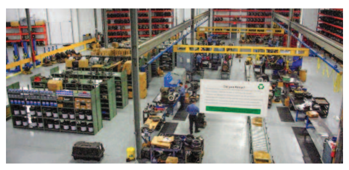
State Of The Art Remanufacturing Facilities