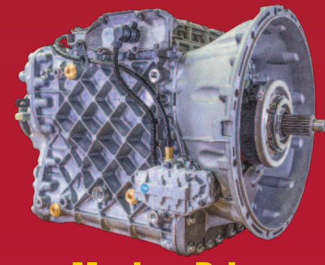
Mack <sup>™</sup> mDrive